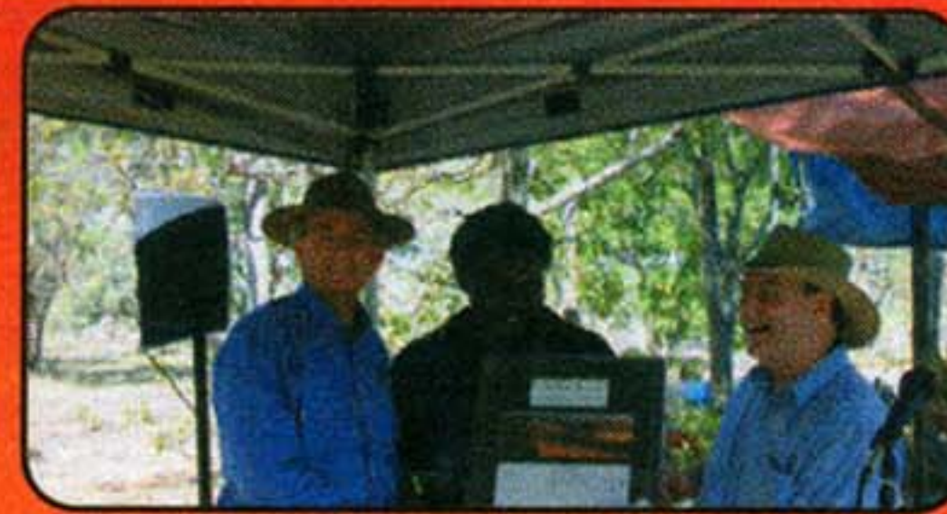
Record handover - Page 7