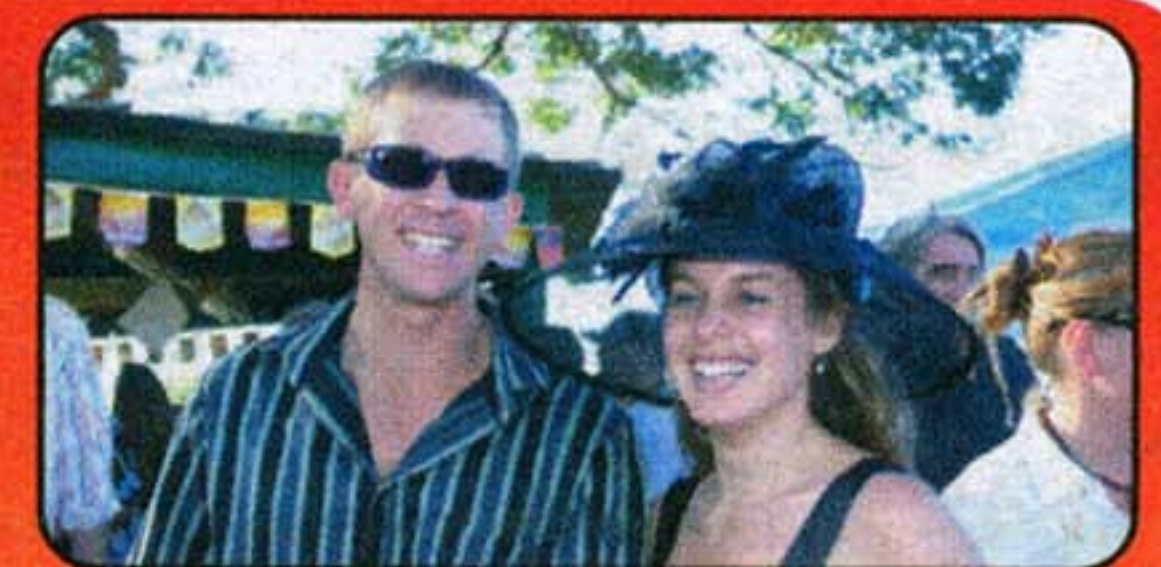
Kununurra races - Pages 12,13 & 23