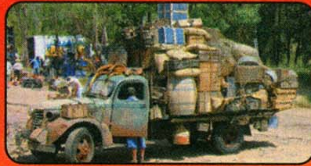
Movie Latest - Page 3